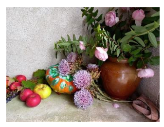
Harvest Flowers at Alvediston

The clergy breathed a sigh of relief when we stopped our the sunshine spring weekly online service in July of 2021, but we still recorded for special occasions. Our service to commemorate the life of HRH Prince Philip received