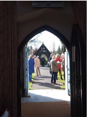
Masks off and into the sunshine spring

While some churches have stayed open since July of 2020, others closed again during the November 2020 lockdown, but all had reopened by the end of May 2021. We have kept to our scaled down rota, and it was only recently we stopped using the temporary 'COVID' orders of services and resumed using the one we'd had before the pandemic.